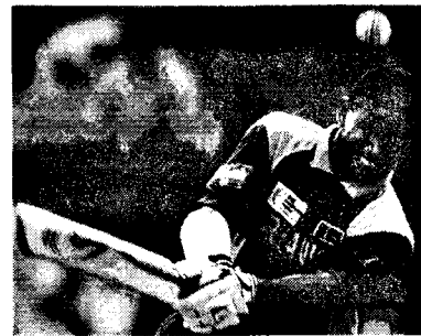
Sanath Jayasuriya, former Sri Lankan cricket captain

ther of these teams and England then the latter would comfortably thrash them. Despite English anxieties about not having won the World Cup since 1966, at least their supporters can console themselves with the fact that their team is considered among the favourites to win it in Germany next year, whereas for India and Sri Lanka qualification is out of the picture. So it could be argued that there is no interest in supporting football in the subcontinent because nobody wants to cheer for a bunch of losers.