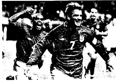
David Beckham, captain of the English football team

The situation in football could hardly be more different. Sri Lanka are currently ranked 141st by FIFA and India are at 135, between Andorra and Malta. England are ranked 7th. Doubtless, if there were to be a football match between ei-