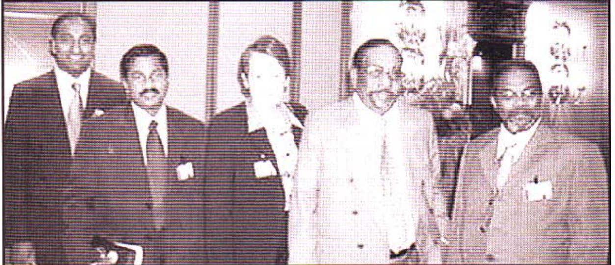
LTTE delegation to peace talks in Oslo (above) Prime Minister Ranil Wickremasinghe and LTTE's Anton Balasingham (below)

VOL XX1 No.12 ISSN 0266-4488 15 DECEMBER 2002 90p