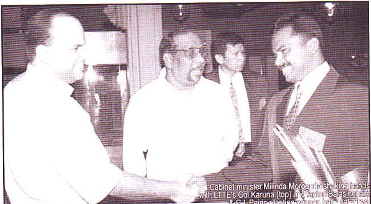
Cabinet minister Milinda Morogoda shaking hands with LTTE's Col. Karuna (top) and Anton Balasingham & G L Peiris planting cannon ball 'sa' tree marking the second round of talks in Bangkok (below)

VOL XX1 No.11 ISSN 0266-4488 15 NOVEMBER 2002 90p