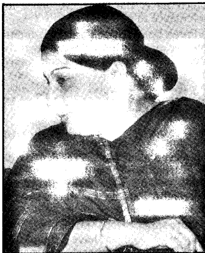
AIADMK leader, Jayalalitha