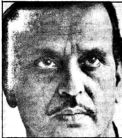
Vishranath Pratap Singh, the Victor

Singh, a poet and painter in private, had drafted his own speech leaving only the English translation to his aides. And long after he had spoken it was being talked about for its earnestness, for appearing to come straight from the heart, and of being shorn of the rhetorical frills and cliches that had characterized the majority of Gandhi speeches.