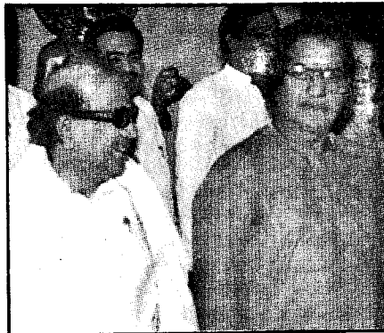
M. Karunanithi; DMK leader and N.T. Rama Rao, Telugu Desam leader – defeated

A stunned Indira Gandhi tried the predictable trick – of splitting the Telugu Desam in 1984 and trying to prop the breakaway faction. But N. Bhaskara Rao, Rama Rao's Finance Minister who pulled off the coup for New Delhi had to be dismissed because he could not muster a House majority despite the Congress support. Rama Rao was back and he called fresh elections to the Assembly before facing the 1984 Lok Sabha elections which his party won decisively (30 of the 42 seats). The Telugu Desam won the Assembly elections again, in 1985.