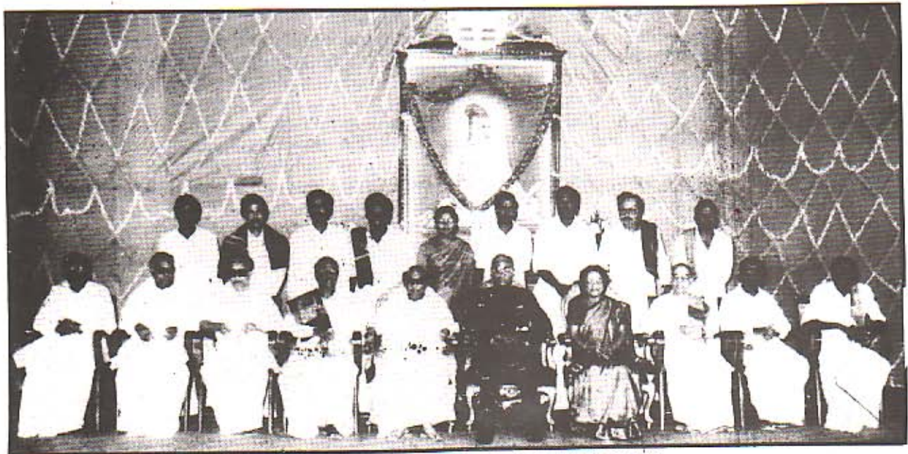
THE TAMIL NADU CABINET

★ FOR RAJIV, SOUTH IS ALL GONE, WILL NORTH FOLLOW