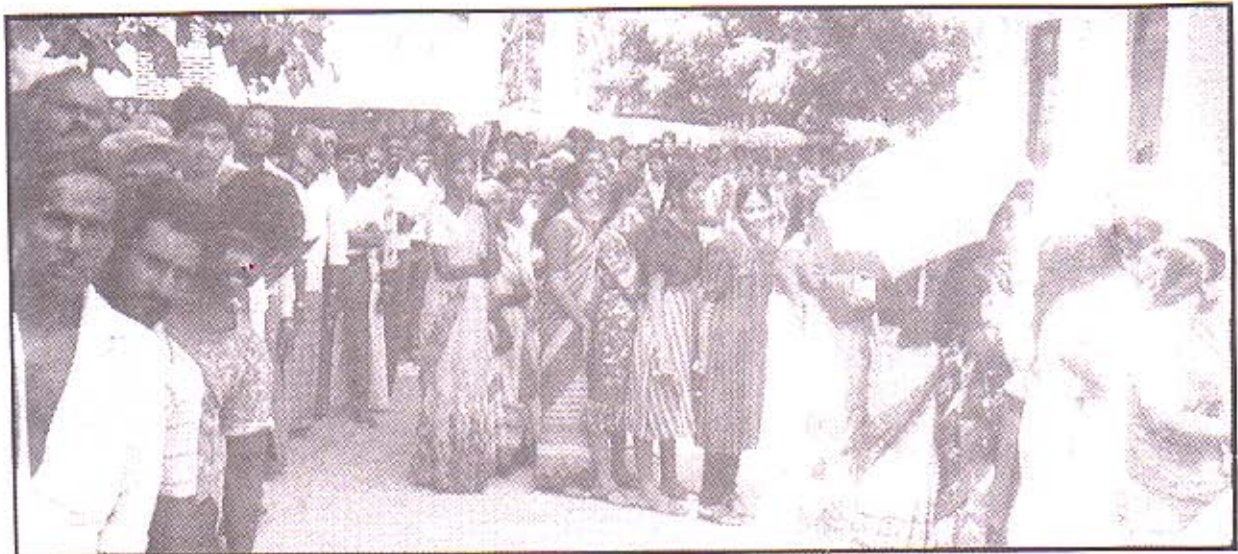
Voters queuing up to vote during Sri Lanka's North-East PC Elections