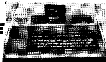
(PHILIPS VIDEOPAC G7000)

We specialise in mail orders. Overseas customers are welcome. Special discount for large orders.