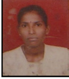
Mother and daughter killed