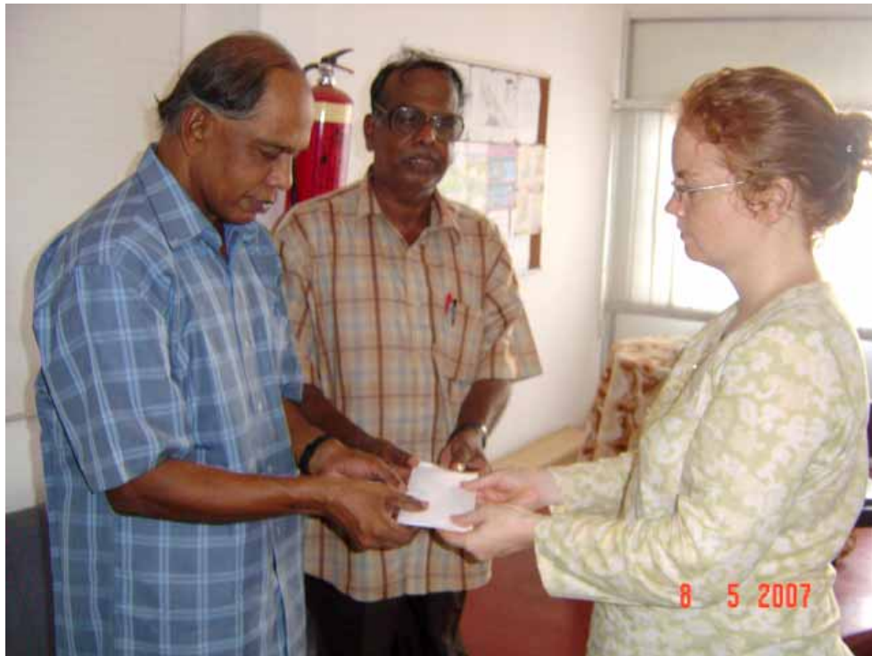
Petition being handing over to UN Residential representative