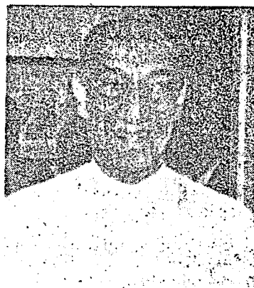
J R Jayewardene: Will he keep the promise to Israelis?