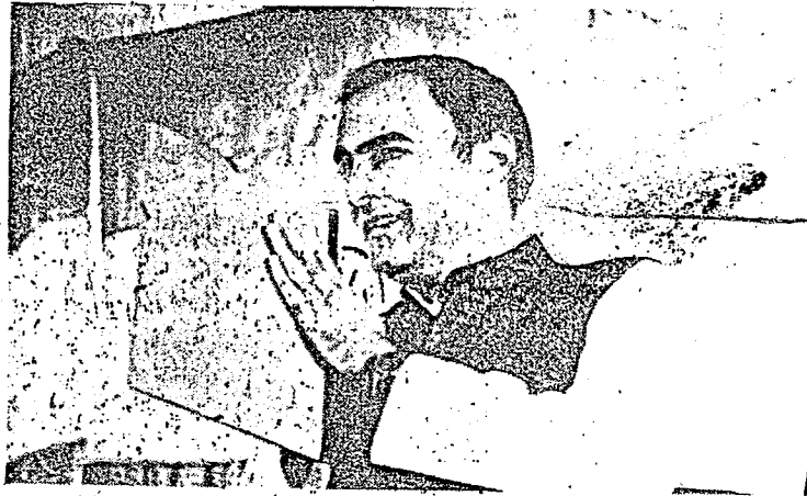
Rajiv Gandhi: Weak and ineffective

The United States' role in Sri Lanka is much less puritanical than the Chinese. Contrary to all propaganda, the US has steadfastly declined to supply arms to Sri Lanka. Jayewardene has been hawking the Trincomalee naval base to the Americans in exchange for a "military supplier's" relationship — which would have meant that Sri Lanka could obtain sophisticated arms from the US at cheap prices. This the US has declined to do, because it "favours" a political solution to the problem. At present, all the US arms that Sri Lanka has, such as the Bell helicopter gunships have been purchased at market prices in Singapore. The US generally supports Sri Lanka in international forums, but at the same time it has not got tough with the Ealem lobby working on US soil. In fact, as the Sri Lanka Finance Minister Ronnie De Mel recently noted, the Ealem group has managed to lobby through a 50% cut in US aid to Sri Lanka. The Ealem associations have been holding international conventions in the USA to propagate their cause vigorously, without serious attacks from the US government. The US attitude