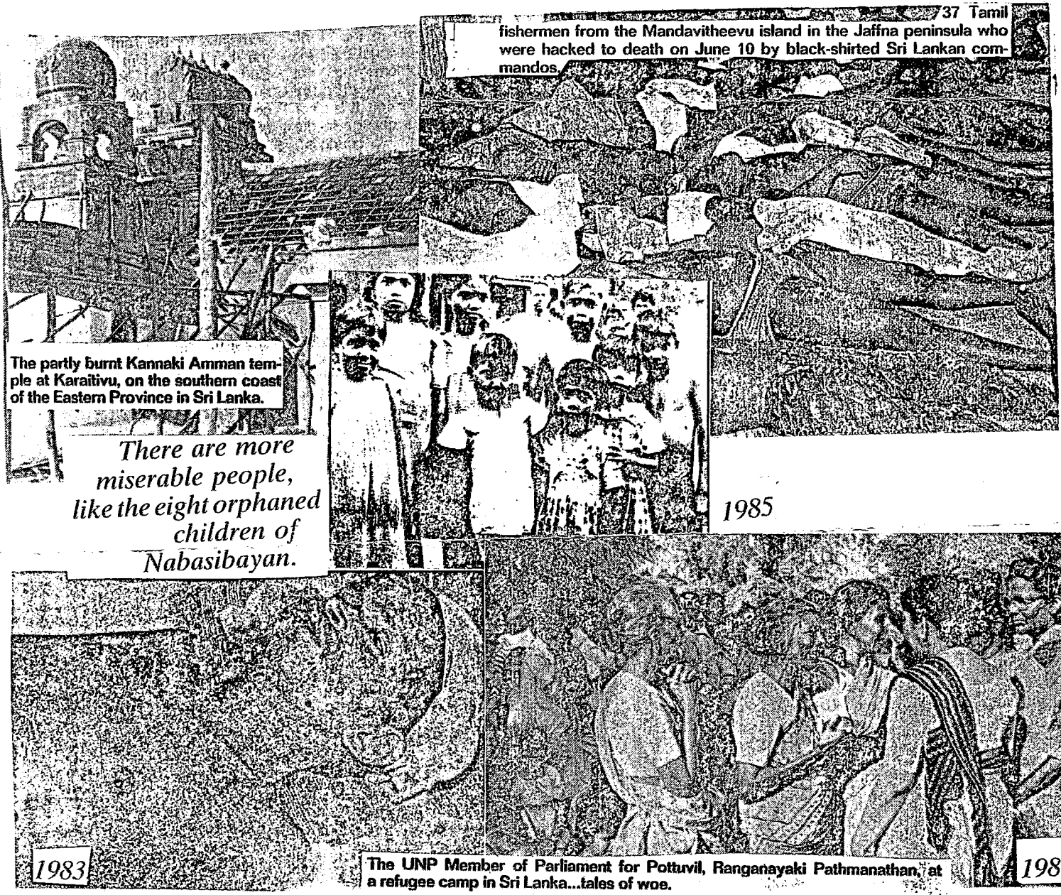
37 Tamil fishermen from the Mandavitheevu island in the Jaffna peninsula who were hacked to death on June 10 by black-shirted Sri Lankan commandos.