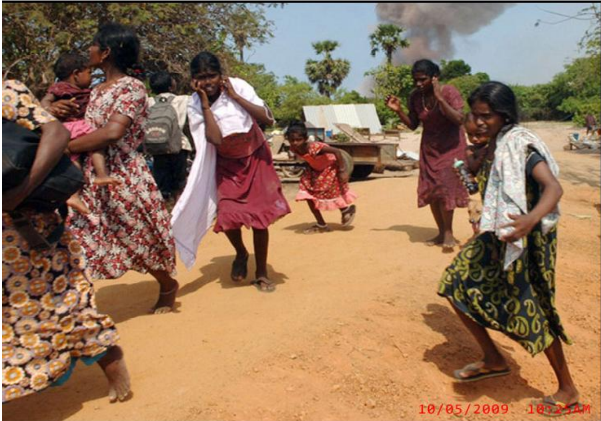
A photo that appeared in Western media and Tamil Net (LTTE website) in May 2009 of the “shelling of innocent Tamil civilians in the NFZ by Sri Lankan army”