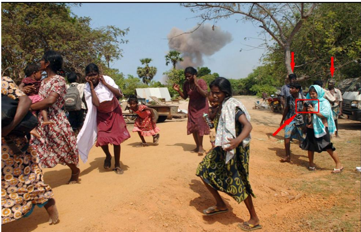
The actual photograph that was staged with a LTTE propaganda team photographing the scene. Note the camerawoman and her assistant smiling in the background.