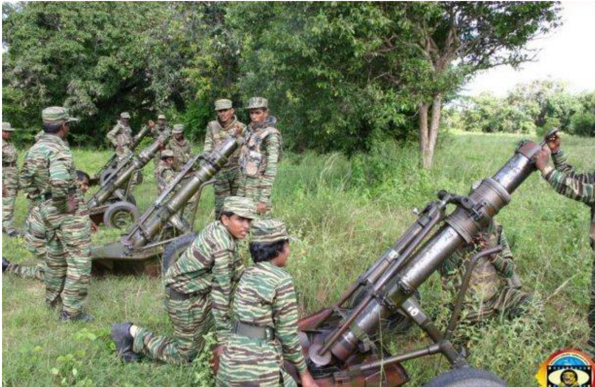
LTTE heavy mortar teams

Government of Sri Lanka or LTTE forces.” 86 (Emphasis added.) That is to say that the United States government, with all the immense satellite and other technological surveillance facilities at its disposal, was unable to ascertain who was responsible for any shelling. In summary, therefore, the UN, the US government, UTHR and satellite surveillance was unable to ascertain whom was shelling whom in the “no-fire zones”. This fact is conveniently ignored by Channel 4 who apparently believe that they are in a better position to judge than the very people on the ground – and in the air – at the time.