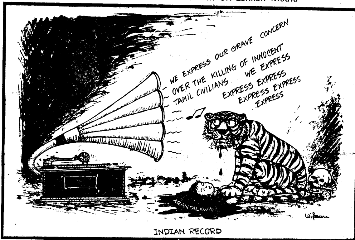
(Island - 12th February 1987)

Another Anti - India Cartoon in Sri Lankan Media