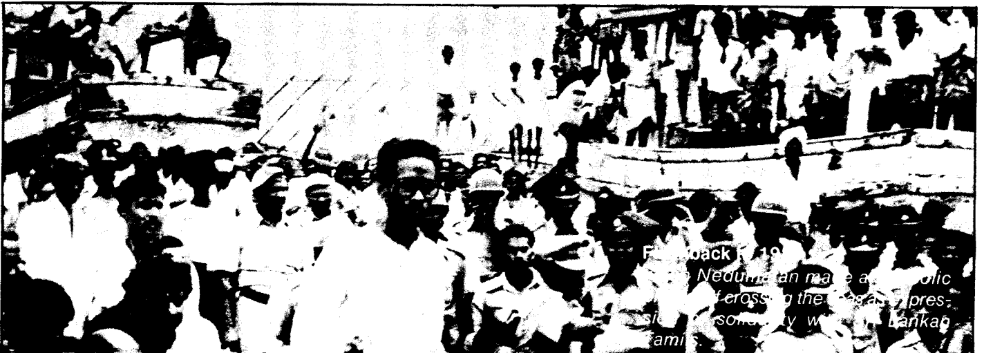
Sri Lanka Situation Report, 7th November 1985

The Government of India desirous as it is, of a negotiated settlement should realise how difficult such a task would be, as long as Lanka's terrorists continue to inspire Tamil Nadu's fanatics.