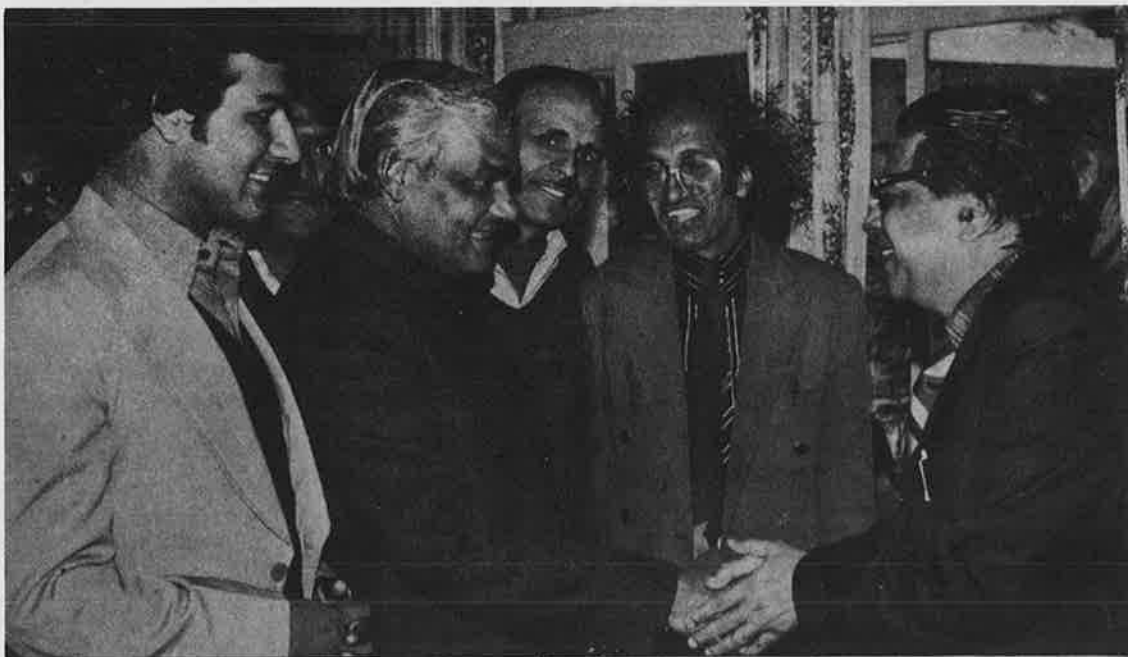
With the Hon. A.B. VAJPAYEE in New Delhi.