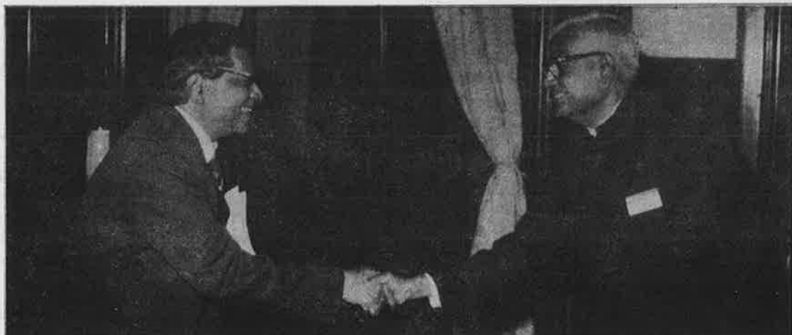
The President of India (then Finance Minister) receiving The Author in his New Delhi Office

Copy to: Hon. The Minister for Foreign Affairs NEW DELHI.