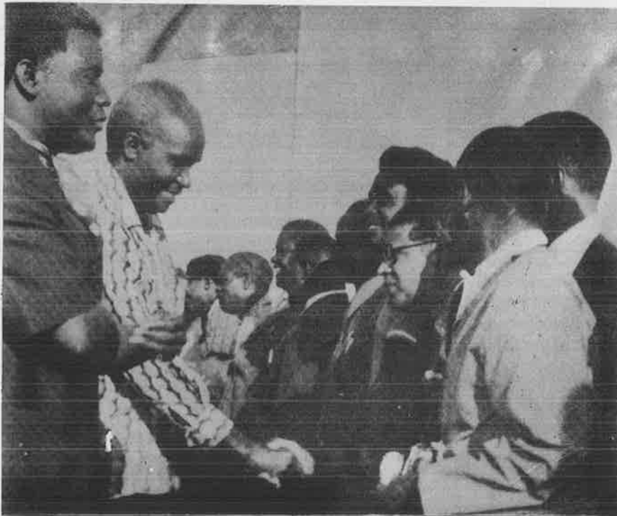
Afro-Asian Solidarity—The Author and other Heads of Government Departments welcoming President Kaunda on his visit to KASAMA the capital of the Northern Province in ZAMBIA

According to him, two youths were killed after having been inhumanly tortured and their bodies flung on the public highway. 147 youths have been taken into custody since the Emergency in July and a large number of them has since disappeared.