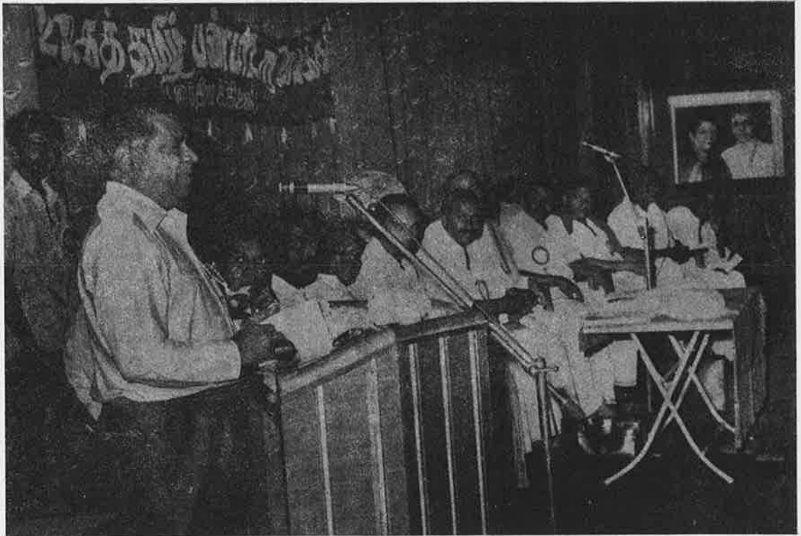
At the meeting held in Madurai, November 1980