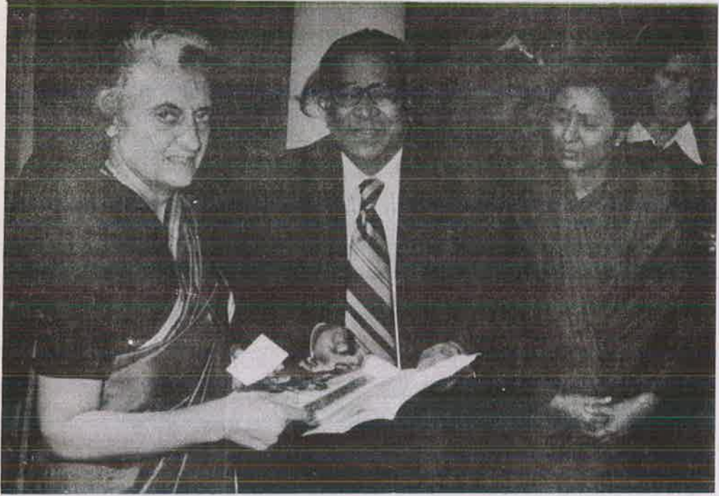
Meeting with Indian Prime Minister Mrs Indira Gandhi 28 January 1980