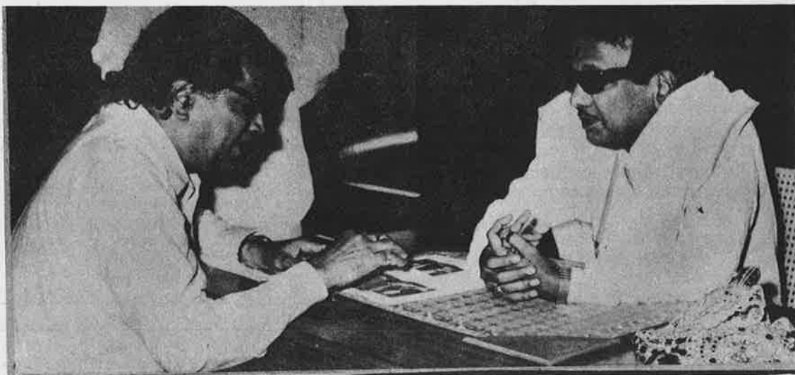
With the D.M.K. Leader Thiru M. Karunanidhi February 8, 1980

With acknowledgements to "INDIA ABROAD", New York