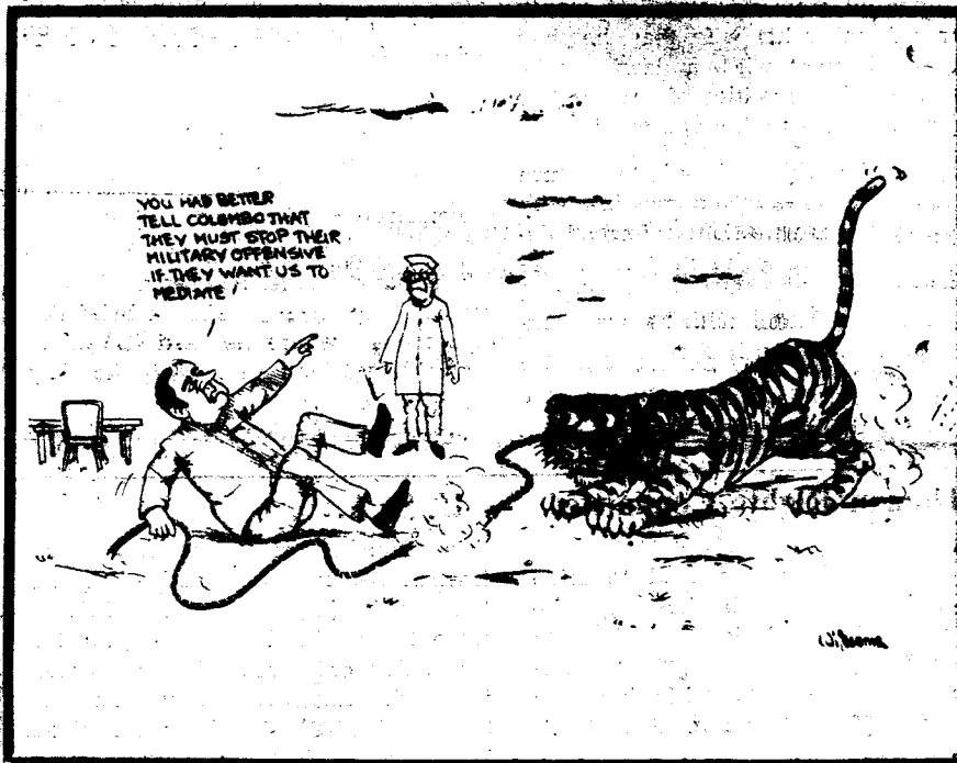
"THE ISLAND" 25th February, 1987.