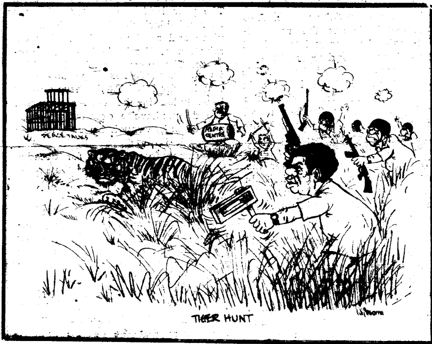
"THE ISLAND" 21st February, 1987