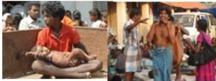
Photo Evidence Genocide/War Crimes committed by Government of Sri Lanka in 2009 1,000 Photographs